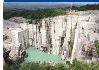
Rock of Ages Granite Quarry