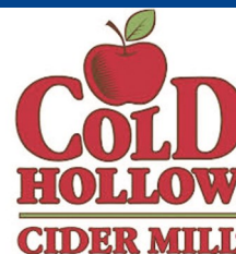
Cold Hollow Cider Mill