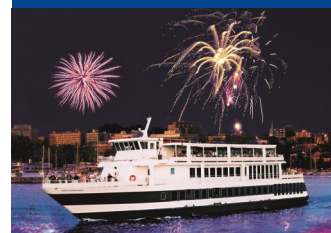
Dinner Cruise on beautiful Lake Champlain