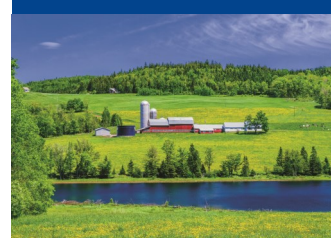
Beautiful Vermont Scenery

Departure: Walmart, 1257 Bellefontaine St, Wapakoneta, OH @ 8 am