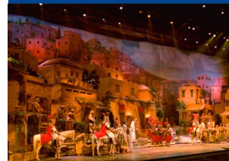
THE MIRACLE OF CHRISTMAS Show at the Sight & Sound® Theatre