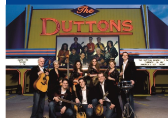
THE DUTTONS CHRISTMAS SHOW

Departure: Walmart, 1257 Bellefontaine St, Wapakoneta, OH @ 8 am